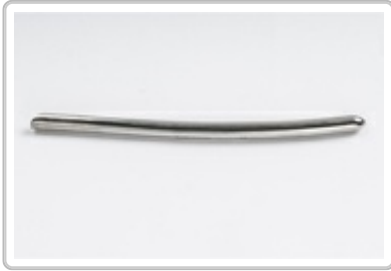
PO214011 : DILATOR HEGAR SIMPLE NUMBER 13