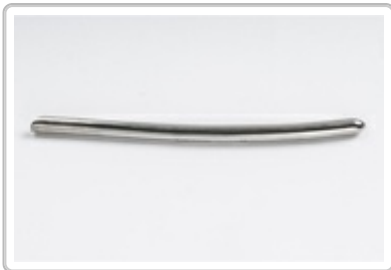
PO214015 : DILATOR HEGAR SIMPLE NUMBER 17