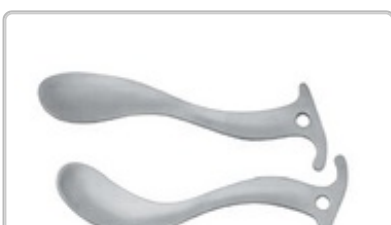
PO211042T : TRACTOR FOR TESSIER FORCEPS