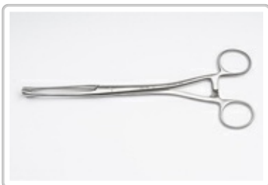
PO211041 : FORCEPS GREEN-ARMYTAGE L=21,5CM