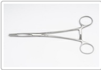
PO211028 : FLAP FORCEP COTT 21CM