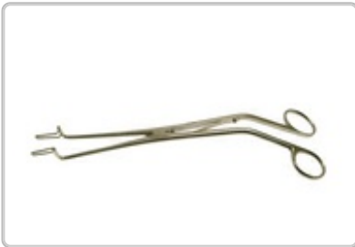
PO211024 : ENDOSPECULUM FORCEPS KOGAN WITHOUT RATCHET 24CM