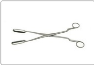
PO211020 : OVUS FORCEPS BONNAIRE 31CM