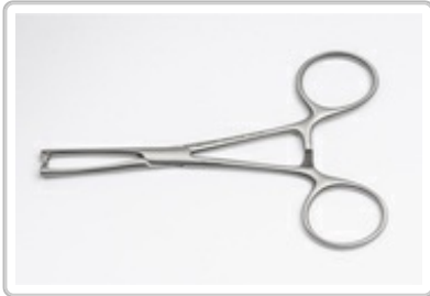
PO211034 : FORCEP MUSEUX 14CM