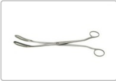
PO211019 : OVUS FORCEPS LEPAGE 27CM