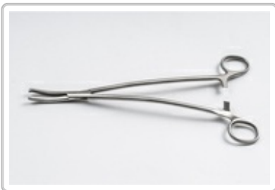
PO211027 : FORCEPS ALLARY L=28CM