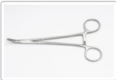
PO211026 : UTERINE ARTERY FORCEPS ROCHARD ANGLED 20CM