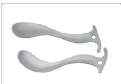
PO211042 : FORCEPS TESSIER 31CM