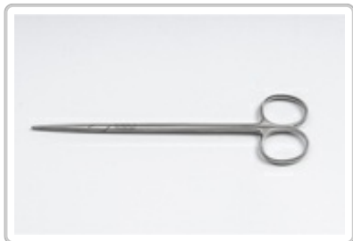
PO146002 : SCISSOR TOENNIS ADSON CURVED VERY FINE 17.5CM