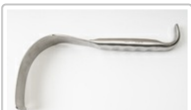
PO261016 : BLADES LERICHE L=26CM W=38MM