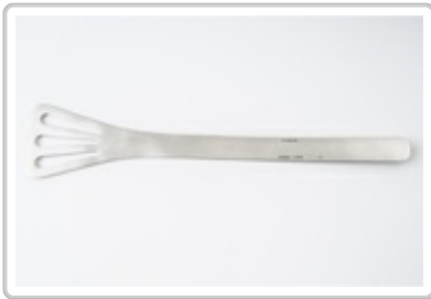
PO261004 : BLADES BLADES CHEVRET L=7,5CM