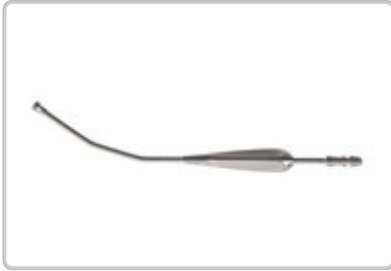
PG162300 : YANKAUER SUCTION TUBE