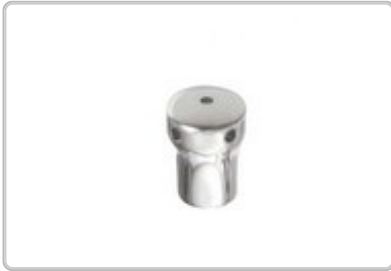
PG162301 : YANKAUER SUCTION TUBE TIP FOR 162300