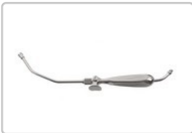
PG162345 : YANKAUER SUCTION TUBE WITH SWITCH VALVE