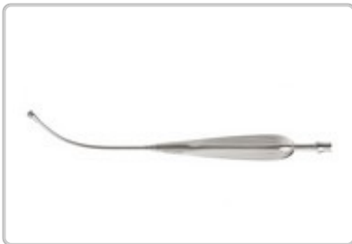
PG162310 : ANDREWS INFANT SUCTION TUBE