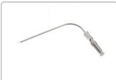
PG162410 : FERGUSON FRAZIER SUCTION TUBE

Stainless steel tubes, block-type finger valve, complete with cleaning stylette. Angled. 4-7/8" (12.5 cm). Pilling Pattern, satin finish. # 0, 6 Fr. tip