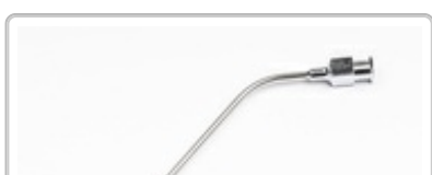
PO271056 : SUCTION TUBES CONE-LUER ANGLED L=10CM D=1,9MM