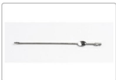
PO271021 : SUCTION TUBE NOWACK 23CM DIAM 4MM