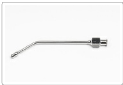
PO271019 : HEPARIN CANNULA N° 3