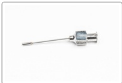
PO271020 : HEPARIN CANNULA FINE MODEL