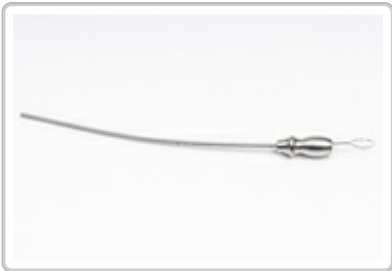
PO271070 : SUCTION TUBE 12CM CURVED OLIVE SHAPED TIP 2.5MM