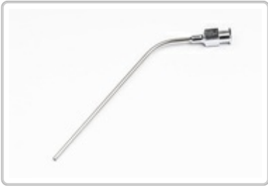
PO271057 : SUCTION TUBE CONE LUER 10CM ANGLED DIAM 2.4MM