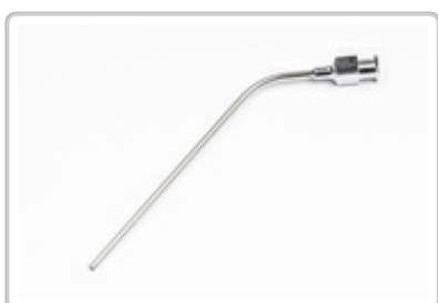
PO271053 : SUCTION TUBE CONE LUER 10CM ANGLED DIAM 1.2MM