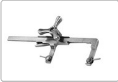
PG342002 : WOLVEK STERNAL APPROXIMATOR