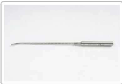
PO215000 : VALLEIX UTERINE SOUND WITH SLIDE L=28,5CM