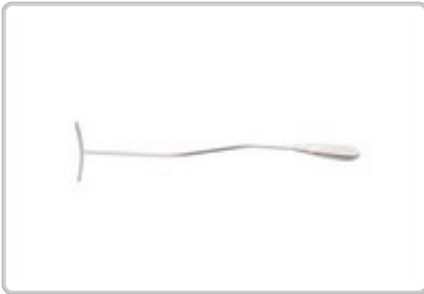
PG351715 : CONN AORTIC COMPRESSOR