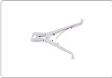
PG342004 : WOLVEK STERNAL CRIMPER