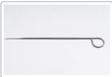
PO215001 : MEMBRANE PUNCH COURSAGET