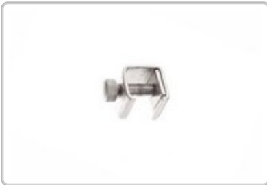
PG354320 : PILLING RATCHET LOCK