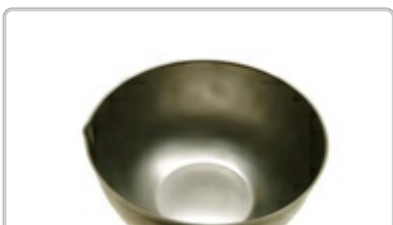
PO471009 : CUP STAINLESS STEEL WITH FLAT BOTTOM & BEAK H=125MM D=255MM