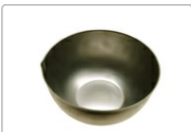
PO471002 : CUP OF STAINLESS STEEL WITH FLAT BOTTOM AND BEAK 30MM