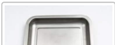
PO471019 : RECTANGULAR TRAY OF STAINLESS STEEL L=22CM W=140MM H=28MM