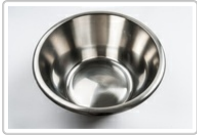
PO471013 : CONICAL TRAY OF STAINLESS STEEL DIAM 200MM