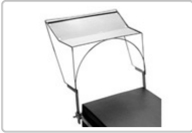
PG343395 : THOMPSON THORACIC INSTRUMENT HOLDER