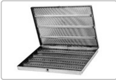
PG429594 : MICRO INSTRUMENT TRAY 12 1/2" (32cm) x 8" (20.5cm), Perforated Top and Bottom