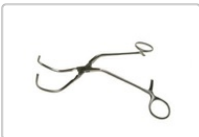
PO353007 : CLAMP KAY LAMBERT FOR ANASTOMOSIS OF ABDO & THORACIC AORTA