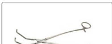
PO353017 : CLAMP SATINSKY 25.5CM