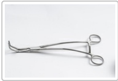
PO353013 : CLAMP DE BAKEY TANGENTIAL 25CM