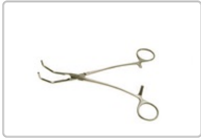
PO353012 : CLAMP DE BAKEY TANGENTIAL 20CM