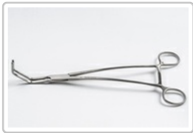
PO353014 : CLAMP DE BAKEY TANGENTIAL 26CM