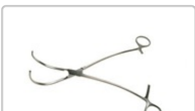
PO353008 : CLAMP DE BAKEY 26CM