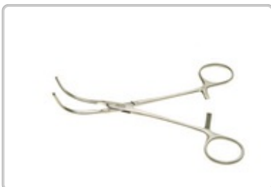
PO352029 : CLAMP DE BAKEY FEMORAL POPLITEAL 16.5CM