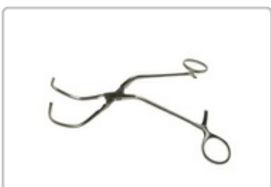
PO353007 : CLAMP KAY LAMBERT FOR ANASTOMOSIS OF ABDO & THORACIC AORTA