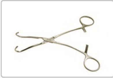
PO352021 : CLAMP DERRE DE BAKEY FOR ANASTOMOSIS 16CM