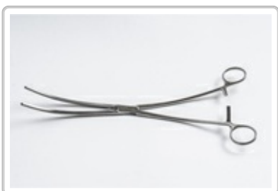
PO353005 : CLAMP DE BAKEY AORTA ANEVRYSM 33CM