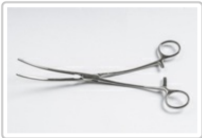
PO353002 : CLAP DE BAKEY AORTA EXCLUSION 24CM