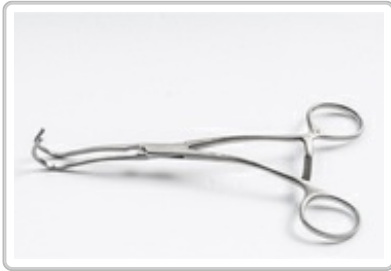
PO352022 : CLAMP DERRA DE BAKEY FOR ANASTOMOSIS 17CM