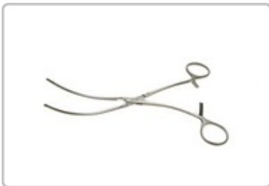
PO352025 : CLAMP DE BAKEY S CURVED 20.5CM