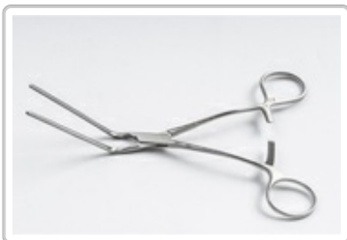
PO352026 : CLAMP DE BAKEY SUBCLAVIAN FEMORAL POPLITEAL CAROTID 18CM