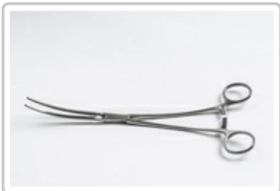
PO353003 : CLAMP DE BAKEY AORTA EXCLUSION 27CM