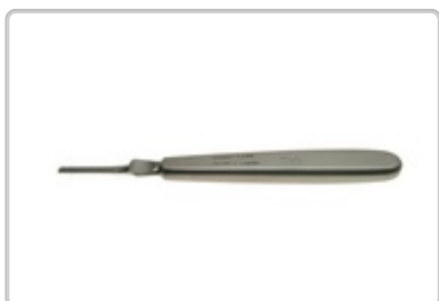
PO341341 : RASPATORY SEBILEAU 15CM CURVED 4MM