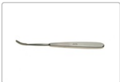
PO341343 : RASPATORIES JOSEPH CURVED L=0,3CM