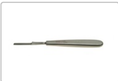
PO341337 : FINGER RASPATORY LELIEVRE CURVED