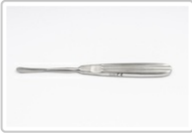
PO341059 : RASPATORY OBWEGESER 17CM MAXILLO CURVED 7MM