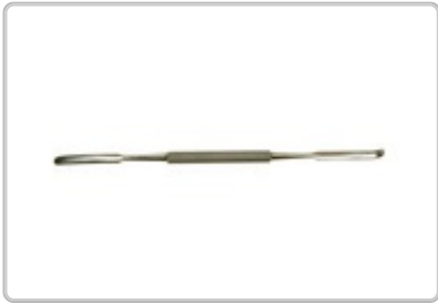
PO341369 : RASPATORIES OBWEGESER SPATULA-SHAPED CURVED L=22CM