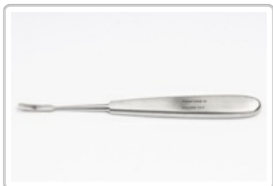
PO341342 : RASPATORY JOSEPH 4MM HALF CURVED