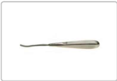
PO341371 : RASPATORY LEMPert 4MM 18CM CURVED