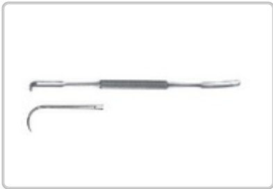
PO341370 : RASPATORIES OBWEGESER SPATULA-SHAPED STRONG CURVED L=22CM