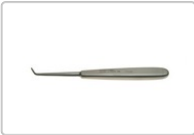
PO341331 : TEDON RASPATORY 17CM