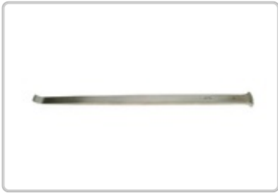
PO341368 : RASPATORY OBWEGESER 23.5CM MAXILLO CURVED 10MM