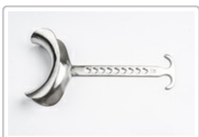
PO261020 : BLADES ROCHARD L=8,5CM