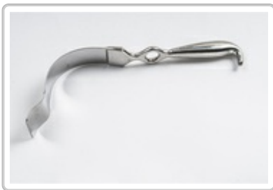
PO261012 : BLADES POLOSSON SOLID L=26,5CM W=60MM