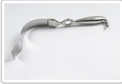
PO261011 : BLADE POLOSSON 26.5CM SOLID 45 MM