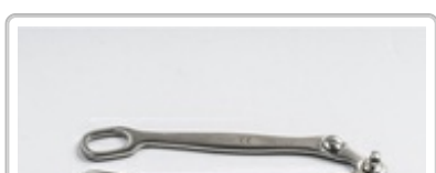
PO261023 : FIXATION DEVICE ROCHARD