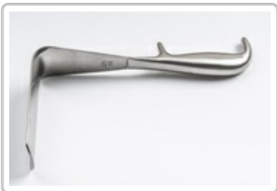
PO261029 : BLADES DOYEN VAGINAL L=23CM W=90MM H=45MM