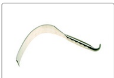
PO261019 : BLADES LERICHE-BUGATTI 30CM 60MM