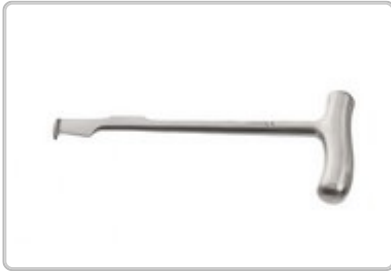
PG342020 : LEBSCHE STERNUM KNIFE

Straight tip, Straight shaft, 9 7/8" (25cm)