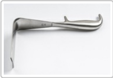
PO261028 : BLADES DOYEN VAGINAL L=24CM W=60MM H=60MM