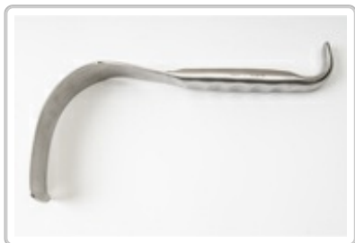
PO261017 : BLADES LERICHE L=28CM W=45MM