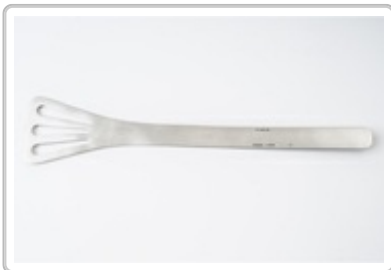
PO261003 : BLADES BLADES CHEVRET L=6CM W=30MM