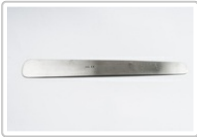
PO261000 : BLADE LARDENNOIS MALLEABLE 27 CM

Straight tip, Straight shaft, 9 7/8" (25cm)