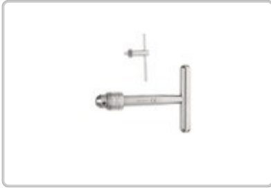
KM48374 : STEINMAN PIN CHUCK