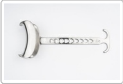
PO261026 : BLADES DOYEN-ROCHARD SUPRAPUBIC L=28CM W=120MM